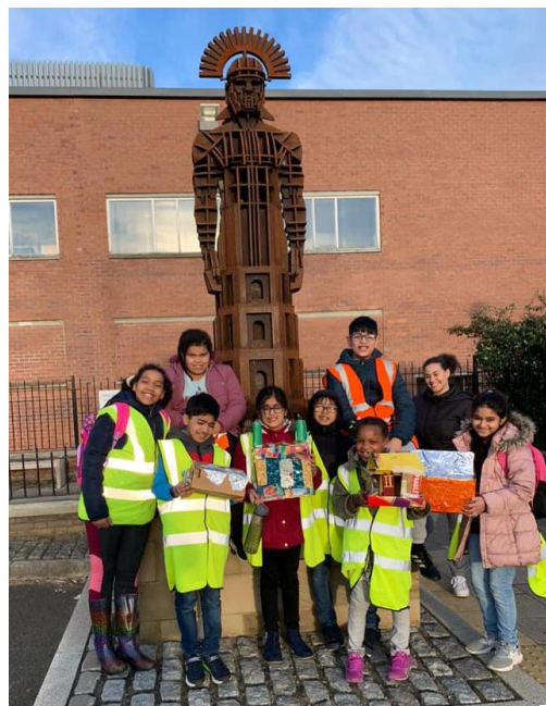
What a great day at Segedunum!

We hope the children and young people enjoyed themselves and look forward to seeing them again soon!