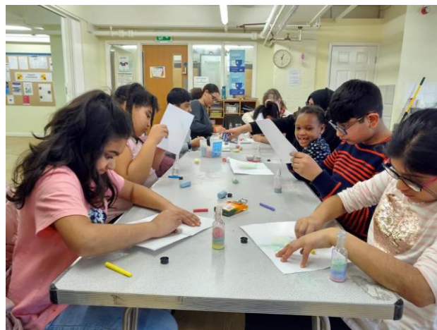
Let's get crafting.

The highlights of the week were our trips out to Segedunum Roman Fort and the Vue Cinema to watch Dr Dolittle!