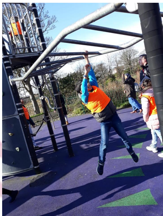
Getting active at our local park.

The highlights of the week were our trips out to Segedunum Roman Fort and the Vue Cinema to watch Dr Dolittle!