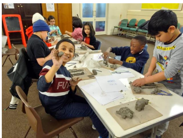
Making pottery shaped like our favourite animals!