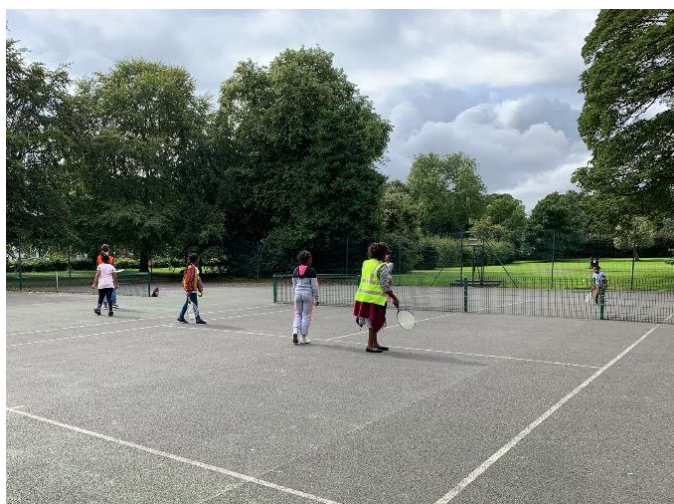
Plenty of sports to keep us healthy and active.

Day 3: We continued our team building with educational team challenges in the morning and then organised various social actions in the afternoon. This included litter picking, cleaning up plant boxes, entertaining care home residents with singing and dancing and some more car washing by popular demand!