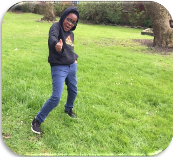
Year 7 Pupil